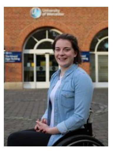
Sport Scholarships 8 Following my own path... a blog