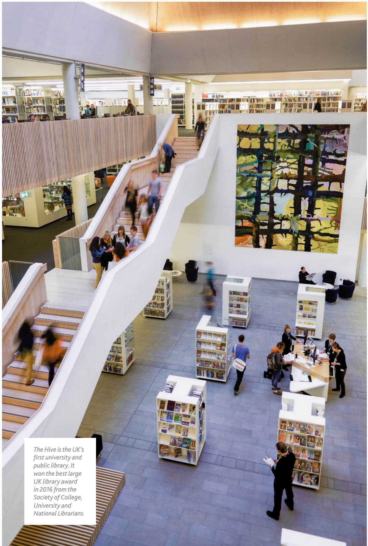
The Hive is the UK's first university and public library. It won the best large UK library award in 2016 from the Society of College, University and National Librarians.