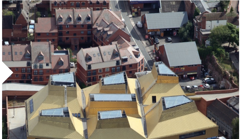
THE HIVE LIBRARY