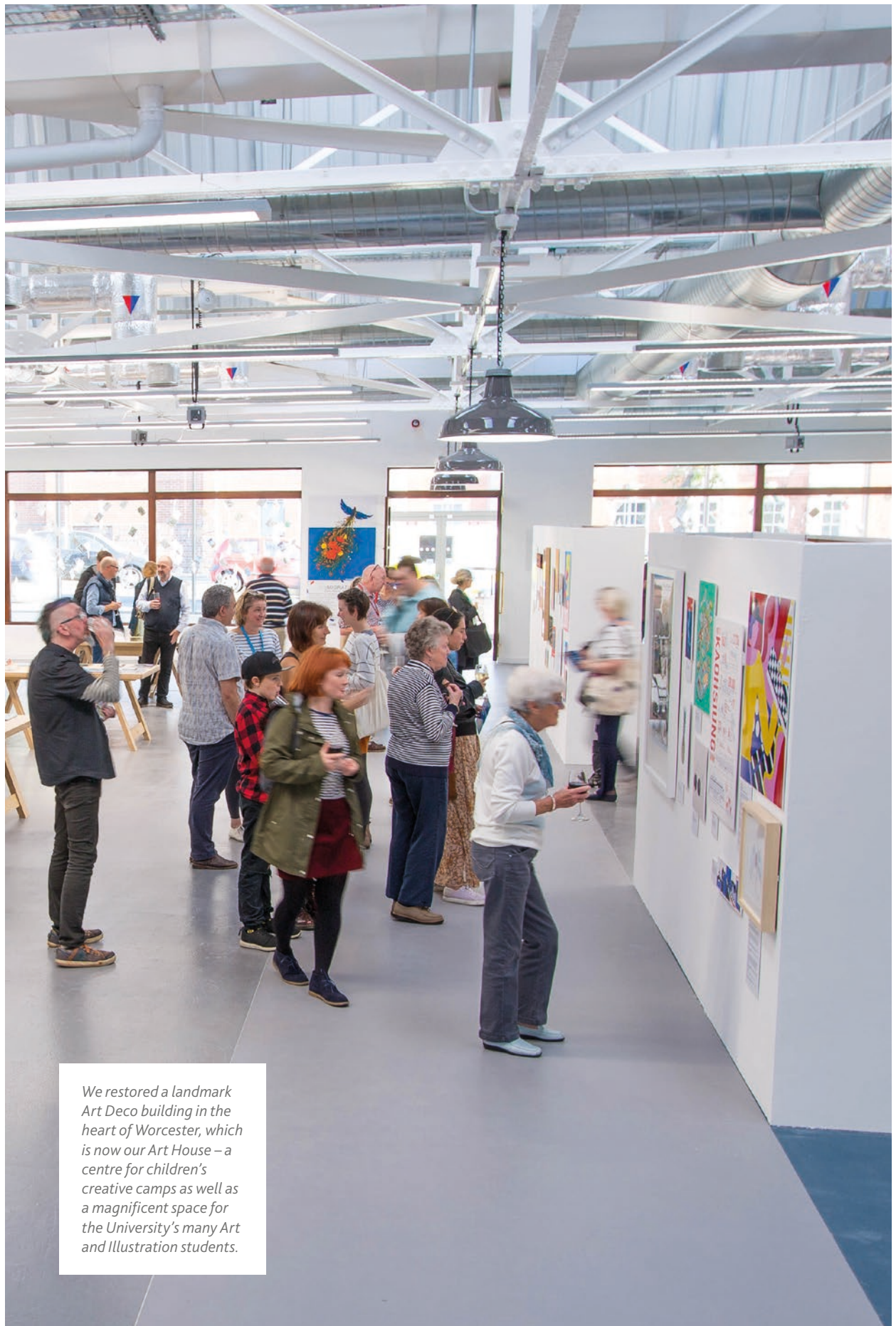
We restored a landmark Art Deco building in the heart of Worcester, which is now our Art House – a centre for children’s creative camps as well as a magnificent space for the University’s many Art and Illustration students.