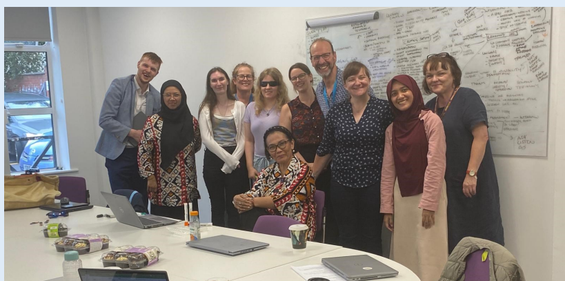
University of Worcester staff and students with colleagues from Universitas Indonesia

The project aims to produce accessible educational resources, enhance lecturer competencies in inclusive teaching, and establish a collaborative network between UK and Indonesian institutions. It seeks to empower students with disabilities by improving their educational experiences and outcomes.