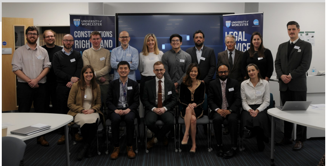
Conference contributors with University of Worcester staff and organisers.